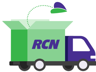
COST OF SERVICE